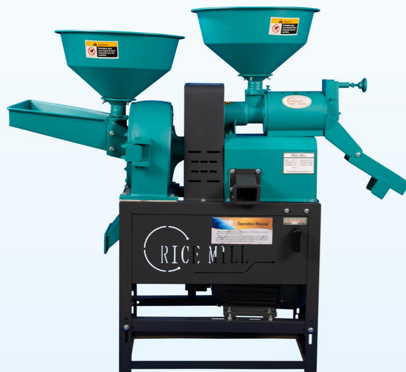
Combined Rice Mill