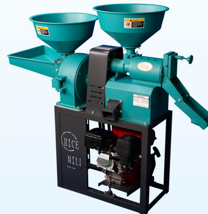
Combined Rice Mill (Gasoline)