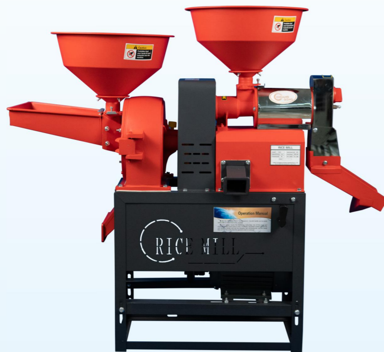
Combined Rice Mill