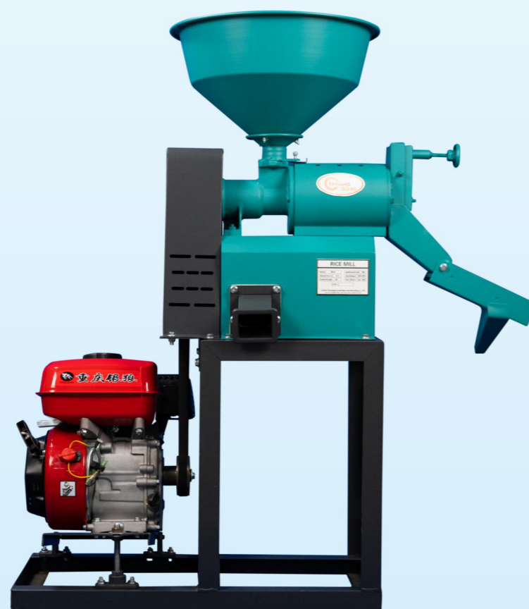
Single Rice Mill