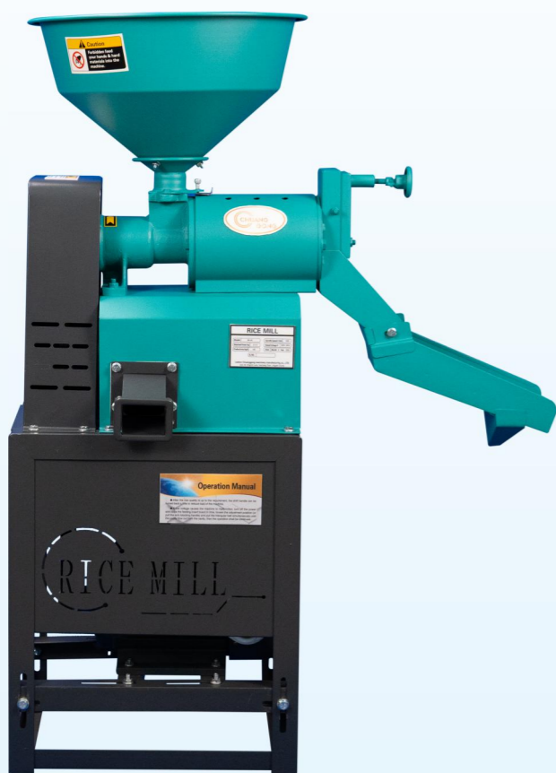
Single Rice Mill