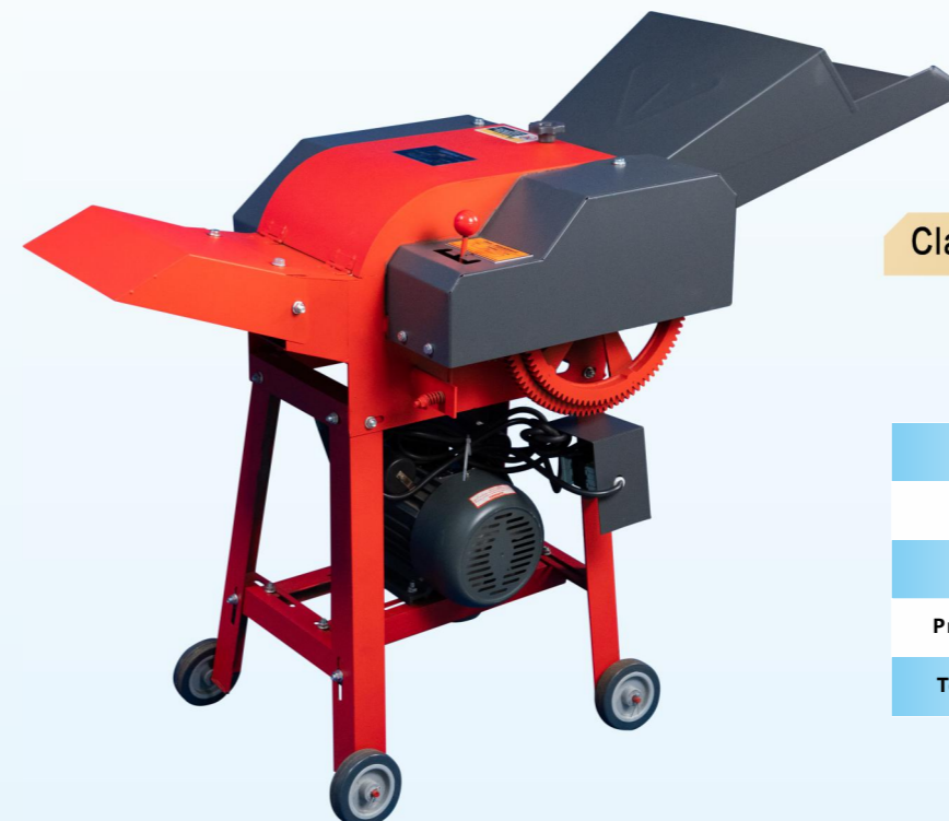
Classical Chaff Cutter (Electrical)