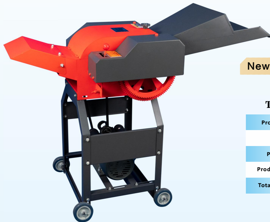
New Chaff Cutter (Electrical)