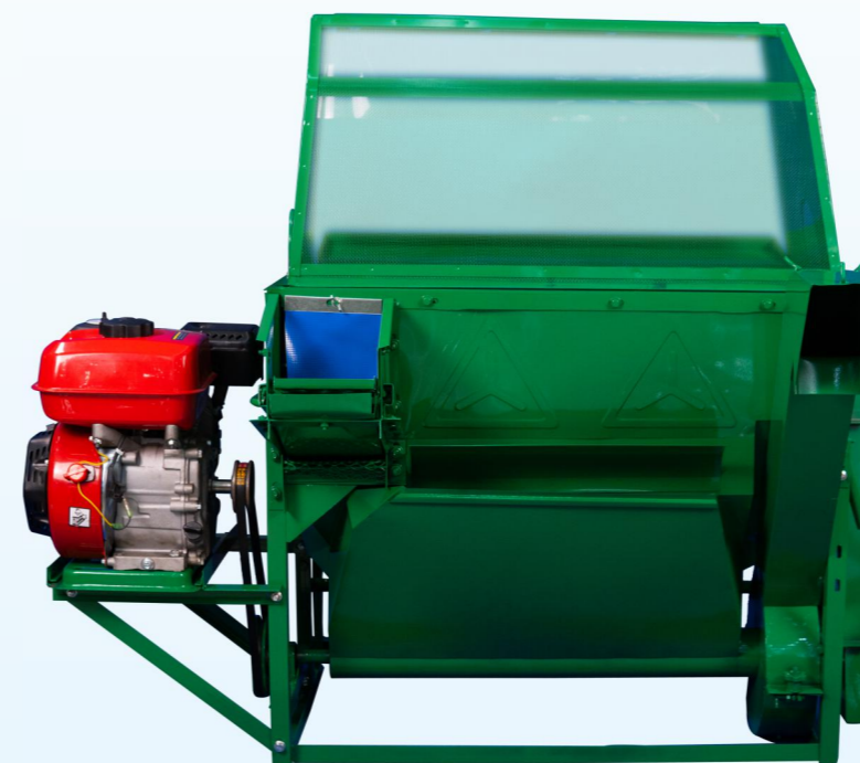
Auto Paddy Thresher