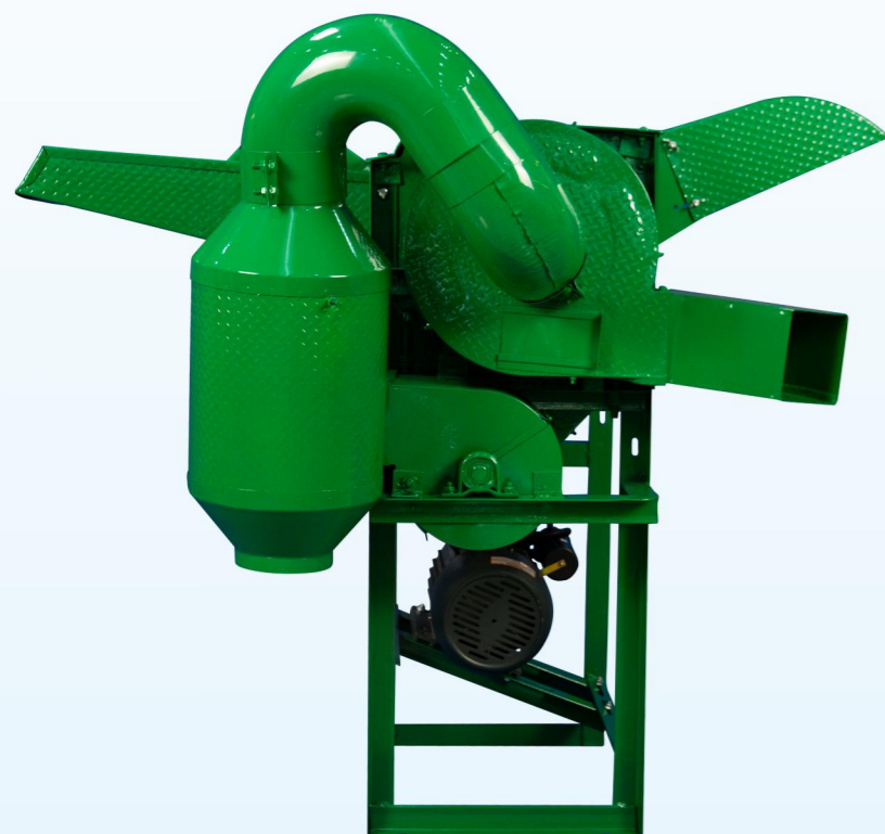
Gt40 Paddy Thresher