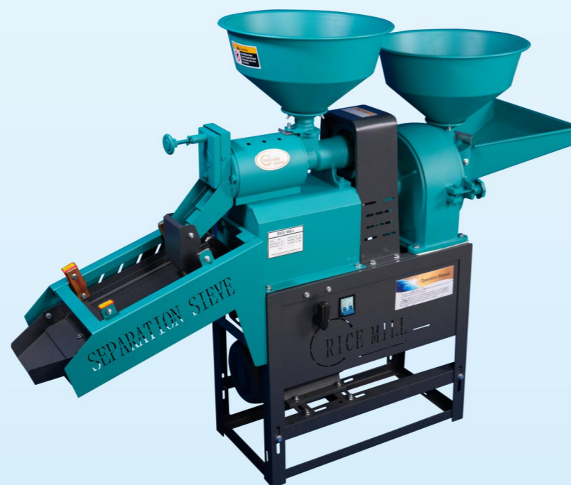
Combined Rice Mill