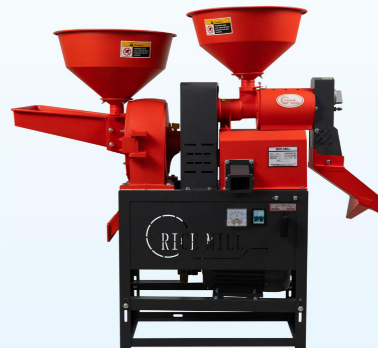
Combined Rice Mill