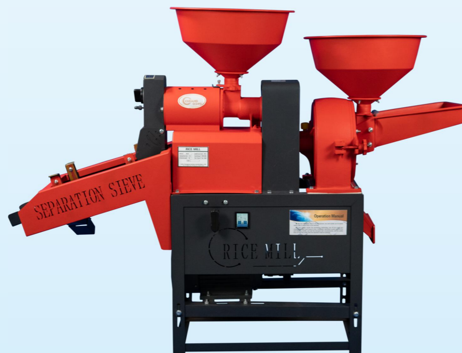
Up&down Combined Rice Mill