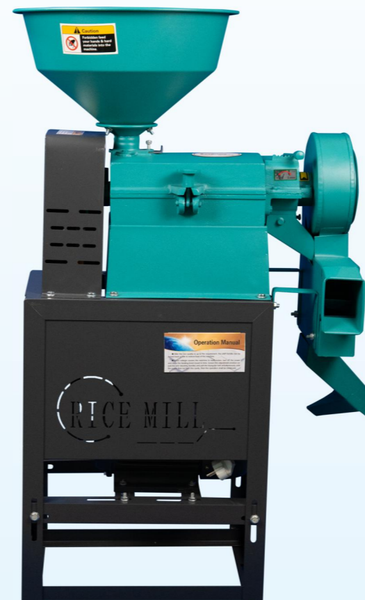
Single Rice Mill