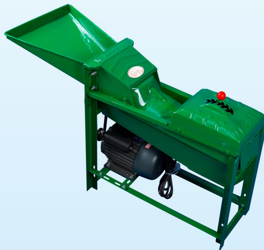
Corn Thresher Machine